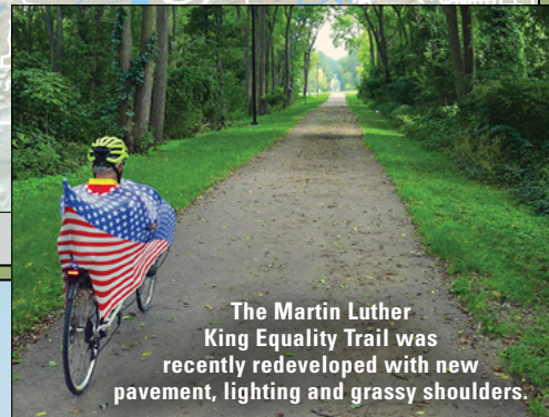
The Martin Luther King Equality Trail was recently redeveloped with new pavement, lighting and grassy shoulders.

At Weatherwax Road, the trail changes its name to the Martin Luther King Equality Trail. This 3.4-mile section of trail travels through quiet suburban neighborhoods, then turns north and follows Cooper Street to downtown Jackson and the Grand River ArtsWalk. Along the way, you can connect with a series of boardwalks and paved trails that encircle a wetlands complex at Cascade Falls Park. Another new section of trail takes you on a 2.5-mile route through Ella Sharp Park.