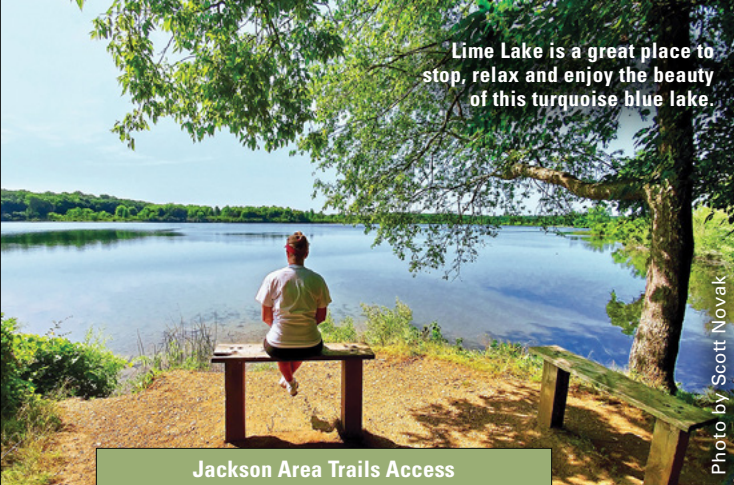
Lime Lake is a great place to stop, relax and enjoy the beauty of this turquoise blue lake.